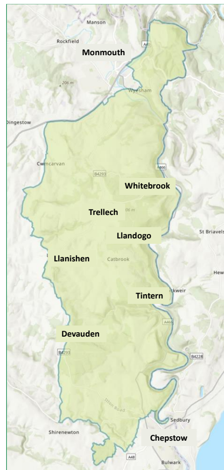
Map 1: The project area (Monmouthshire's Wye Valley AONB)

The Welsh Government funding could be used to cherry-pick one track or trail and spend the money on sorting out a part of that - it might cover the cost of a footbridge, a low-key natural drainage scheme and re-surfacing a few metres of trail - but that would only resolve one issue amongst a wide range of issues across the network. So, we are taking a step back, looking at the network as a whole and listening to our local communities, partners and visitors as to what they think are the priorities. Also, crucially, the strategy and action plan